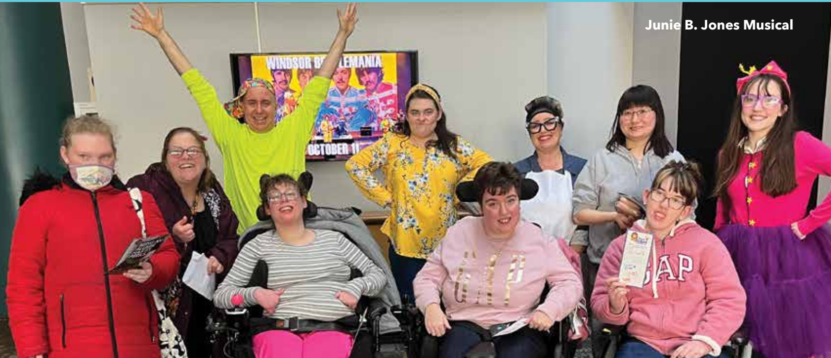
Junie B. Jones Musical

Our families enjoyed many wonderful events throughout the year, sharing, connecting and having fun!. Here are just a few of the highlights