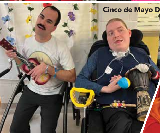
Cinco de Mayo Dance