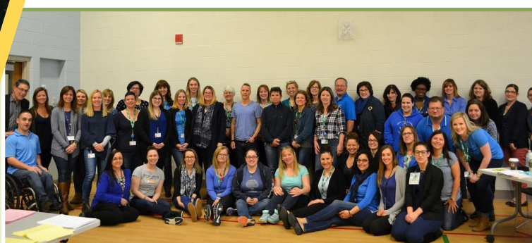
▼ Light it Up Blue for Autism Awareness