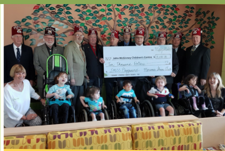
◀ Moramos Shriners present a cheque in support of Play McGivney

In 2017, thanks to support from our community, JMCC opened Play McGivney, a state-of-the-art accessible playground in our side yard which is enjoyed daily by JMCC clients and families and the community. This accessible playground is perfect for all ages and abilities, thanks to our partnership with Hotel-Dieu Grace Healthcare, that resulted in a unique intergenerational space.