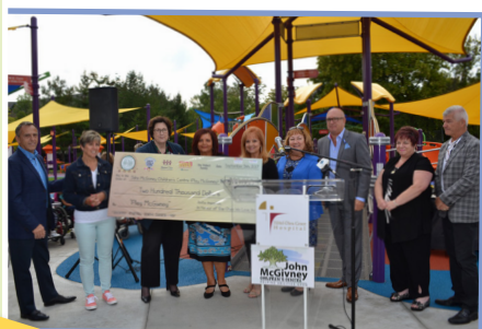
◀ Play McGivney Grand Opening