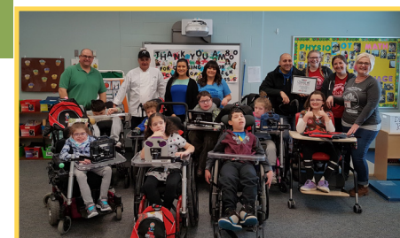
◀ JMCC School Authority Class 5 awarded Class of the Week by AM 800, CTV Windsor & Monarch Basics