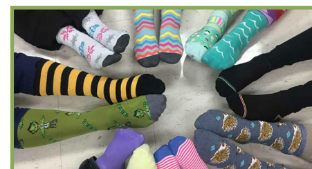
◀ Rocking our socks for Down Syndrome Awareness