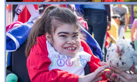
◀ Super Hero Fun Day