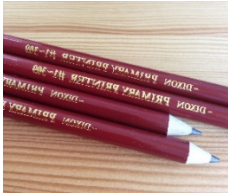
Primary Pencils (cut them in two or three)