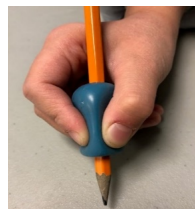
(The Pencil Grip)