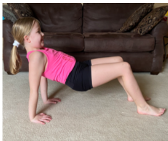
Animal walks: Crab Walking

(lie on back, slide hands up to knees, lift head off floor)