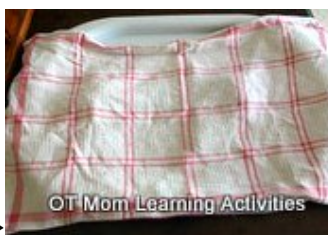
OT Mom Learning Activities