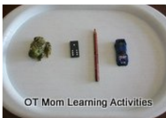
OT Mom Learning Activities