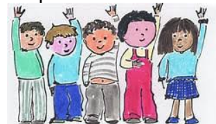
Simon says: "Put your left arm up!"