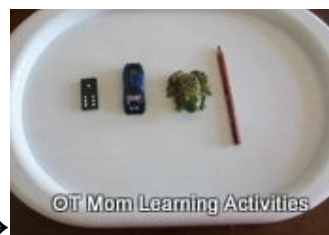
OT Mom Learning Activities