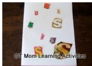
OT Mom Learning Activities