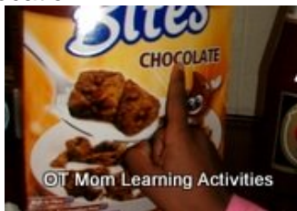
OT Mom Learning Activities