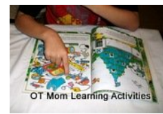
OT Mom Learning Activities